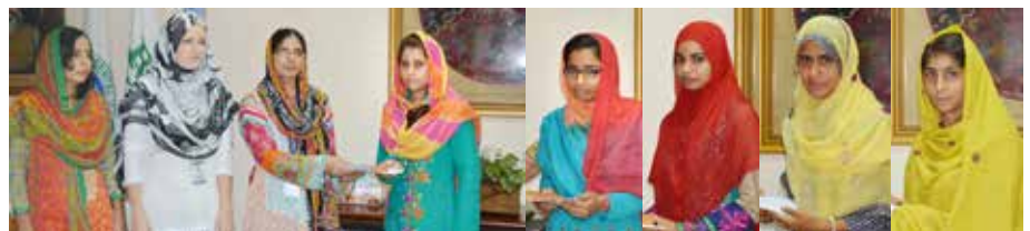
Participants of Fehm ul Quran & Computer Course receiving certificates

August, certificates were awarded to the participants.