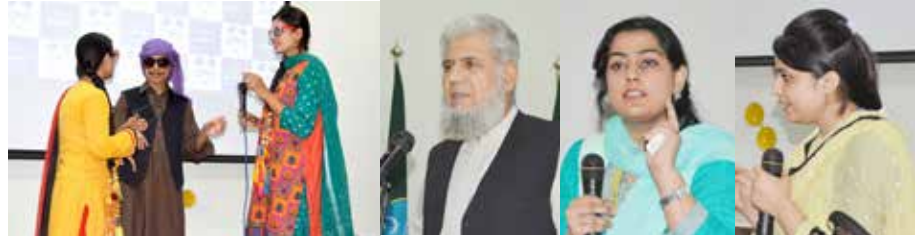
Students performing in the skit

seminars for the awareness of common people. Stalls displaying Polarized Sunglasses and Contact Lenses were also put in place by the respective department.