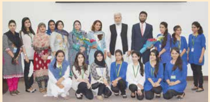
Students of Management studies with Guests and senior faculty members