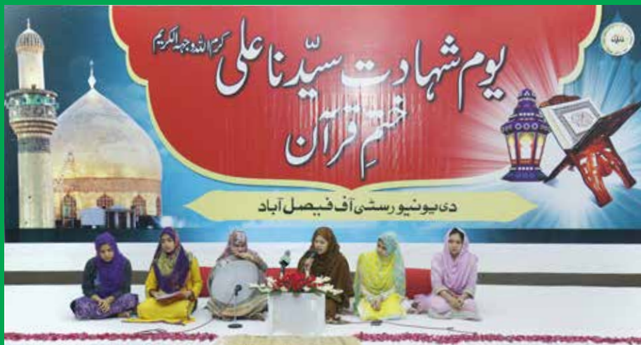
Students presenting Manqbat of Hazrat Ali Karram-Allah-Wajhahu

Religious Society, The University of Faisalabad observed Youm-e-Shahadat of Syedina Hazrat Ali Karram-Allah-Wajhahu on July 8, 2015 at Saleem Campus. Khatm-e-Quran was also arranged on this occasion.