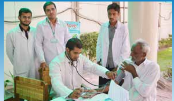
Free Physical Therapy Camp