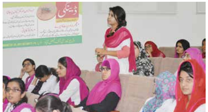
Questions Answer session