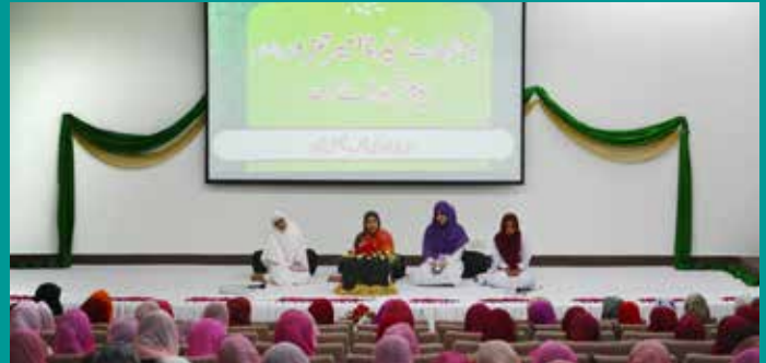
Students paying tribute to Syedna Ameer Hamza (AS)