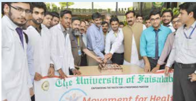
TUFIANS along with senior management and faculty members observe Physical Therapy Day