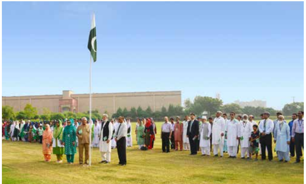
Flag hoisting ceremony at Saleem Campus