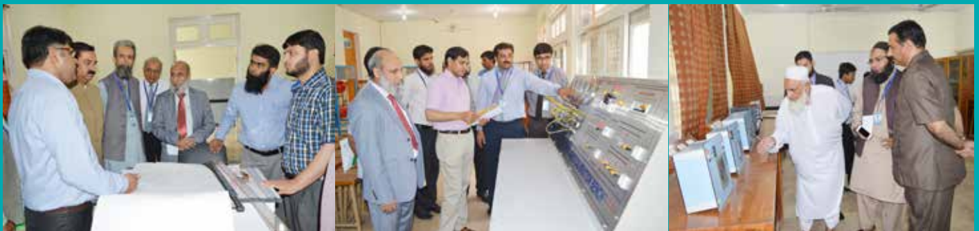
Members of PEC team visit Textile Engineering, Chemical Engineering and Electrical Engineering labs

respective Heads of Schools gave presentations about the teaching, research and other functions of their Schools. The teams met the faculty members as well as the students of each school and listened to their views concerning education and other facilities. The teams visited all labs in each school and met the lab engineers and other staff and questioned them about the conduct of practicals, maintenance of apparatus and other aspects. The University hopes that the notification of these accreditations will be issued soon.