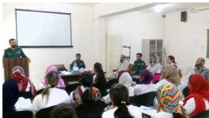
MBBS students attending Workshop on "Basic Life Support (BLS)"