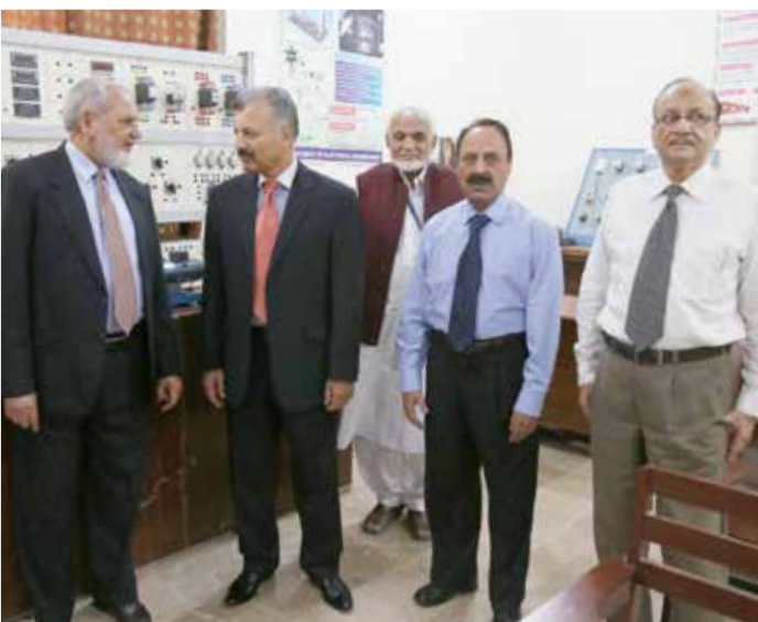
Visits Electrical Engineering Lab