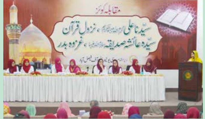
Competitors of Quiz competition

The winners were awarded Prizes and Certificates.