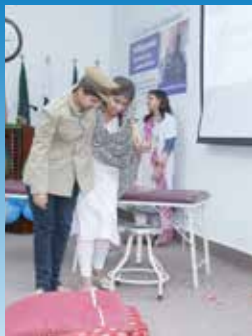
Students present a skit