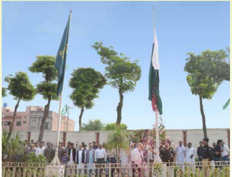
Flag hoisting ceremony at Amin Campus