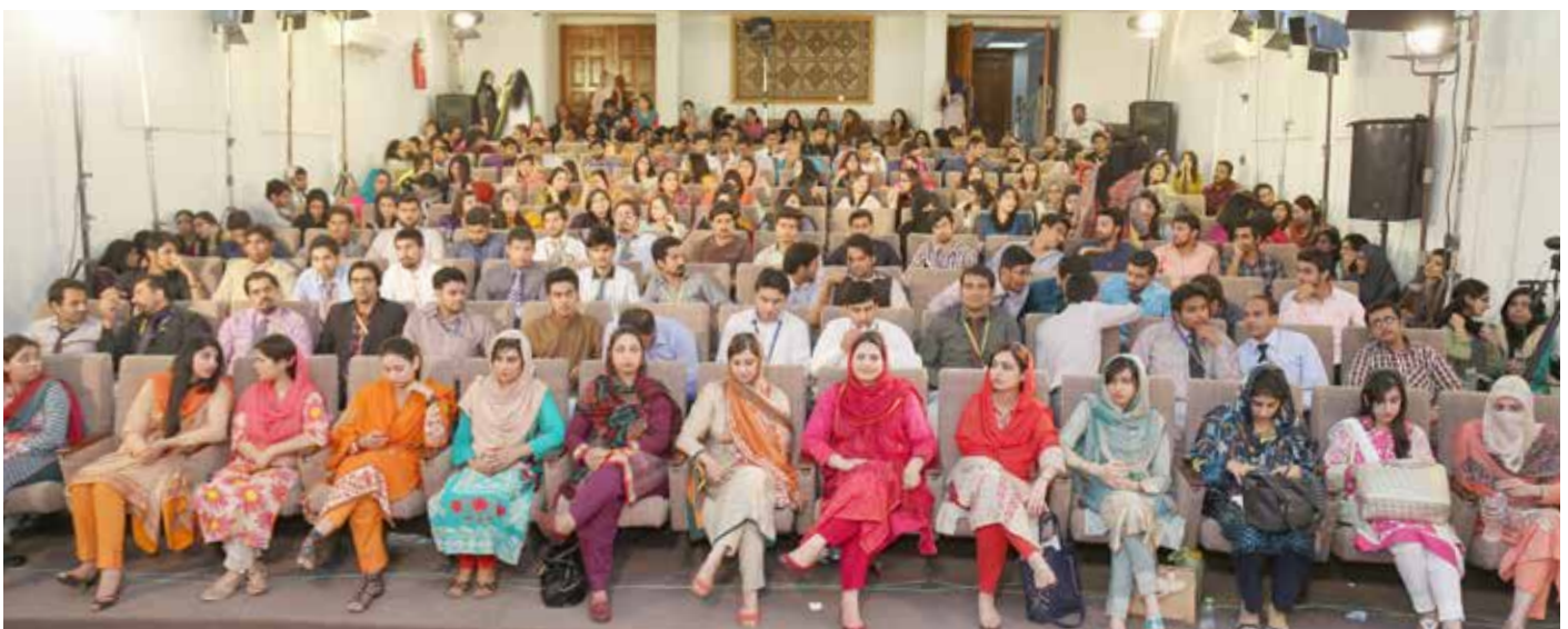
Glimpses of Eid Show