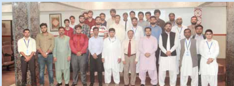
Faculty members and students on the occasion of Youth Day celebrations

Everyone should focus on their self development in order to stand out in the modern day work environment and society.