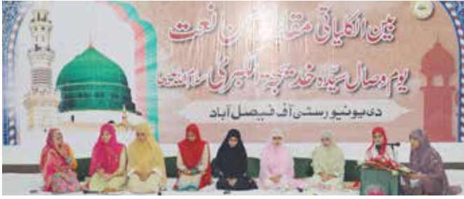
Participants of Naat competition

devotion to the Islamic injunctions practiced by Hazrat Khadija-Tul-Kubra (SA).