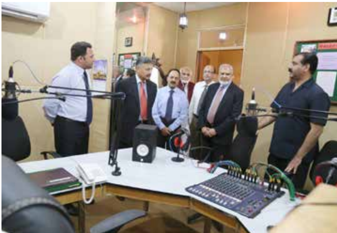
Visits Radio TUFANS FM 96.6