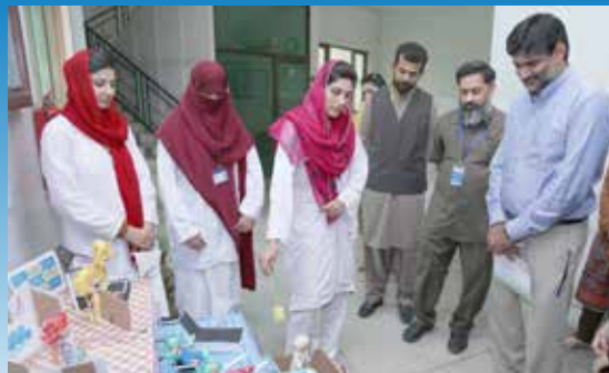
Students showing their projects