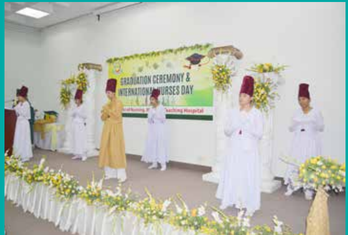
Students of Nursing School performing on Sufiana Kalam