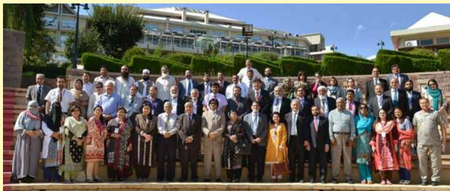
Participants of national consensus guidelines meeting at Bhurban

In addition, this meeting served as a forum for academia and experts in medical education to exchange views and share ideas regarding innovations in teaching and learning.