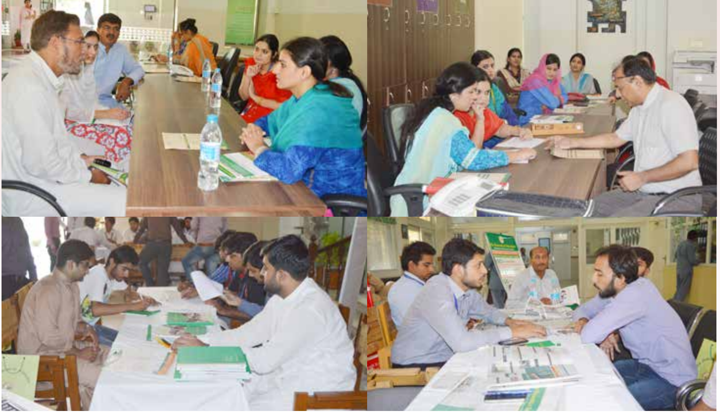
Glimpses of Open House Sessions at TUF

the present corporate sector requirements. Students and their parents also visited the state of the art laboratories, furnished class rooms, sports area and residential facilities. Visit to the affiliated Madinah Teaching Hospital was a special attraction.