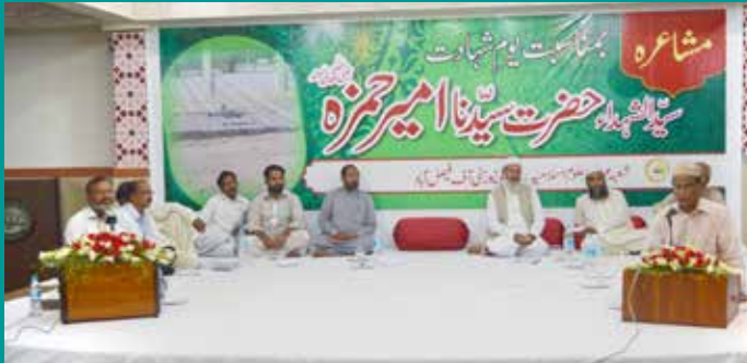
Poets offer Manaqib