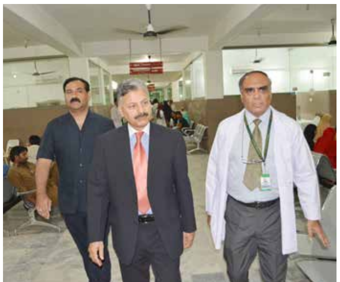
Visits Madina Teaching Hospital