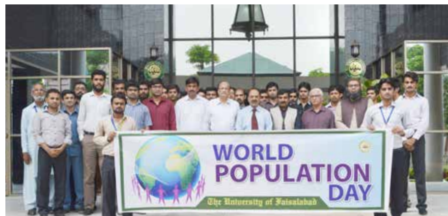
Faculty members and students during awareness walk on World Population day