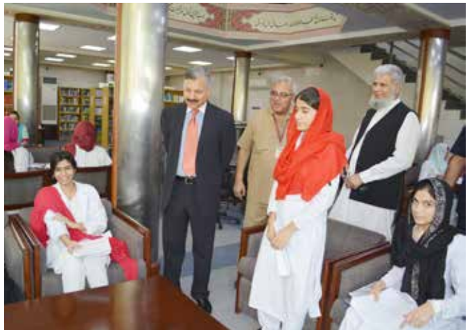
Sharing views with TUFANS in the Library